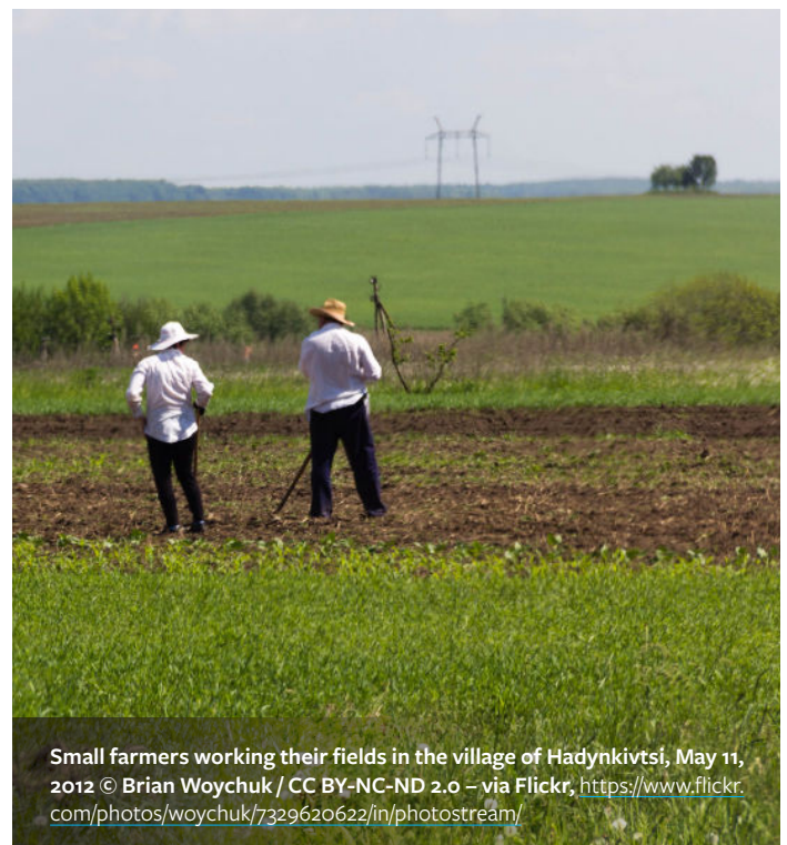
Small farmers working their fields in the village of Hadyinkivtsi, May 11, 2012

The above can be the basis for the transformation of the agricultural sector in Ukraine to make it more democratic, environmentally, and socially sustainable, in a way that benefits the majority of the people – guaranteeing the right to “high-quality and safe domestically produced food.” 216 International policy and financial support should be geared towards this transformation, to benefit people and farmers rather than allowing colonization by oligarchs and foreign financial interests. 217