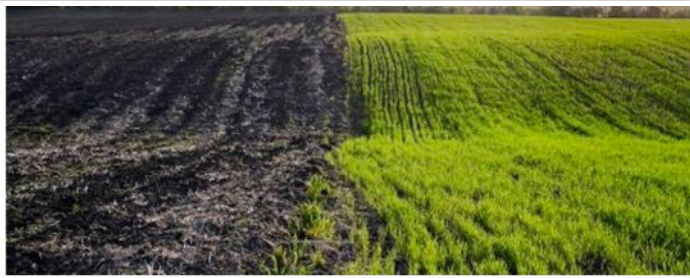
Friends in the Dnepropetrovsk region, Ukraine. Inefficiently managed resources, including agricultural land, remain a drag on growth