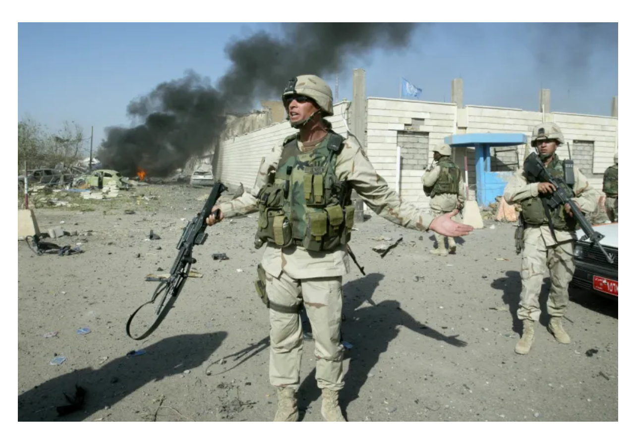
A U.S. soldier redirecting people in the aftermath of a bomb explosion, Baghdad, August 2003