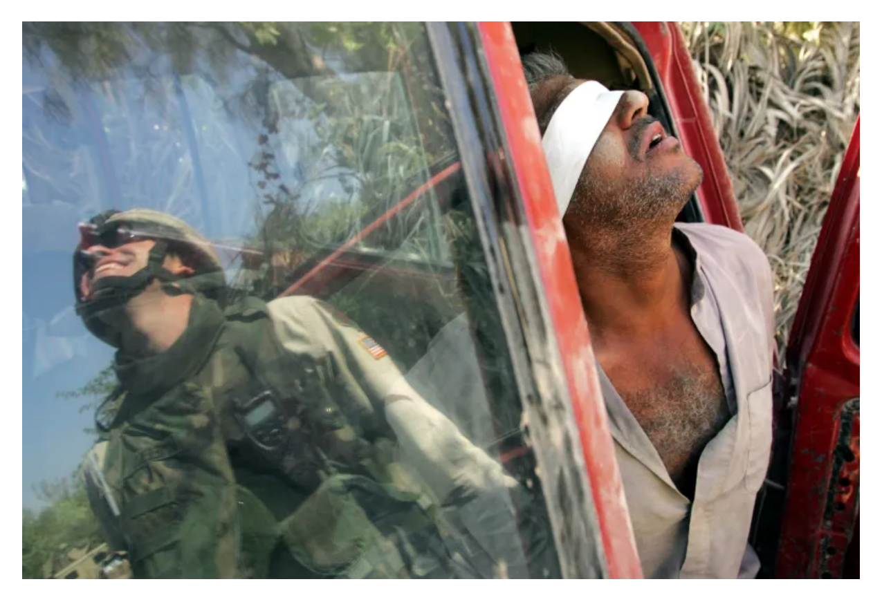
An Iraqi man suspected of having explosives being detained near Baquba, Iraq, October 2005

By then, the American public was turning against the war and Washington's excuses. Over the next decade, voters delivered three electoral surprises that revealed the depth of their discontent. Invading Iraq was supposed to demonstrate American power and Washington's will to shape the world, unconstrained by internal doubt or external norms. When political elites proceeded to treat the war as a tactical mistake, born of incorrect intelligence or insufficient planning, they did not eliminate the sense of existential purpose with which they initially invested the invasion. Instead, they tried to paper over the war's deeper meaning, only to be hit by blowback at home, as well as abroad.