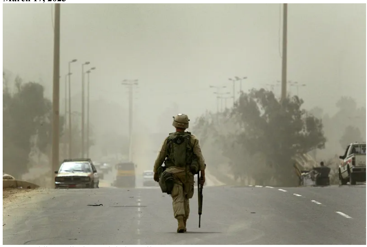
A U.S soldier walks in Baghdad, April 2003